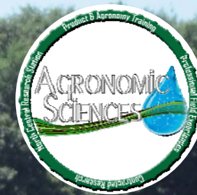
Fertilizer Method of Application Comparison for Soybeans North Central Research Station - 2010