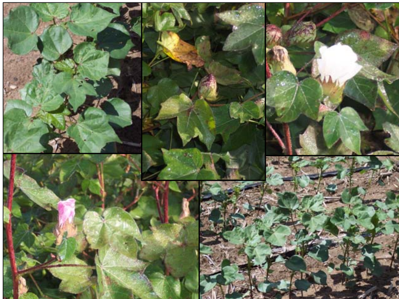
Cotton plants pictured above have a number of different growth stages including different flower colors.

Each picture below shows the fertilizer rate and depth of planting listed below the picture. The left rows had fertilizer placed in-furrow and the right had fertilizer placed 2 x 2. Complete stand count is listed in the upper corners of each.