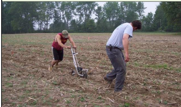
Picture 1. It took two people to run the single row planter, one to push and add down pressure for depth and one to help pull and guide through the plots.