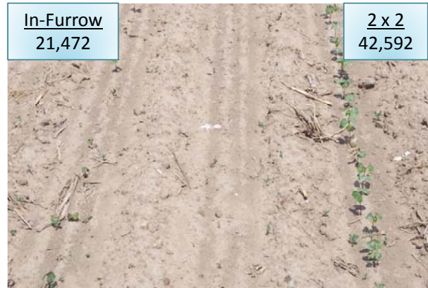
Figure 4. normal - high fertilizer rate

The above figures show pictures taken 23 days after planting. In each figure the left row has the fertilizer placed in-furrow and the right 2 x 2. Population based on stand counts for each row is in the corresponding box in each corner.