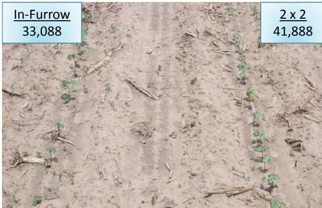
Figure 3. normal – low fertilizer rate