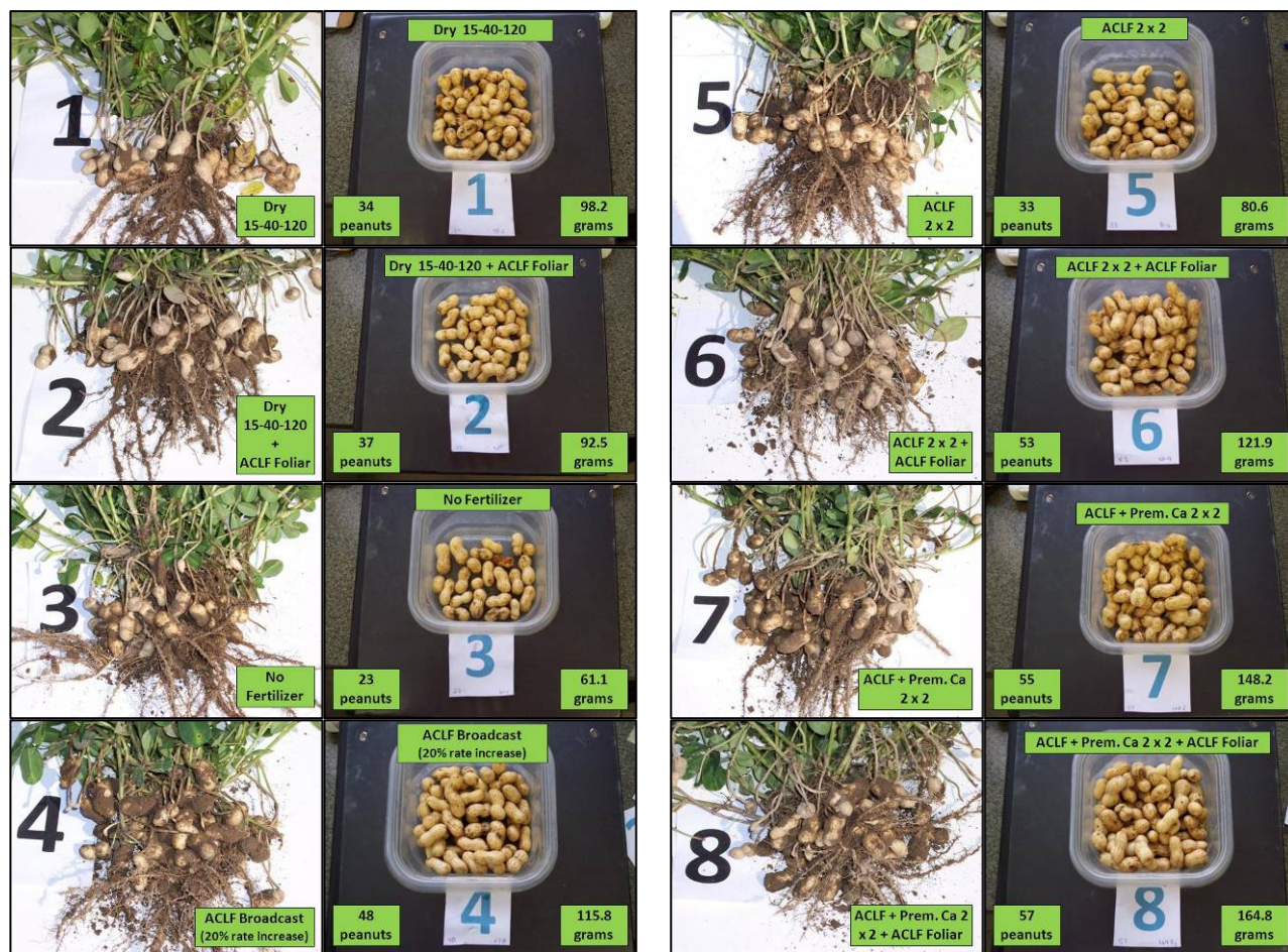
Table 1. Fertilizer Effects on Peanut Counts and Weights