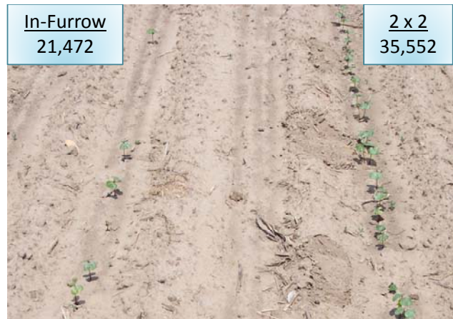
Figure 2. deep – high fertilizer rate