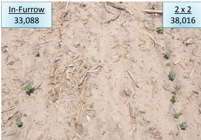
Figure 1. deep - low fertilizer rate