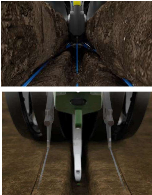
Figure 1. Conceal® and FurrowJet® Fertility Placement

Results: Table 1. illustrates the AgroLiquid fertility program achieved an excellent average yield gain of +14.6 Bu/A. Table 2. depicts net returns tallied a positive return on investment of +$18.95/A.