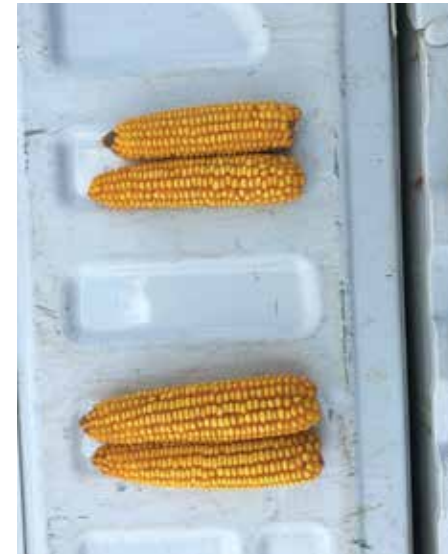
Top Non-Rx Dry vs. Bottom Rx Program