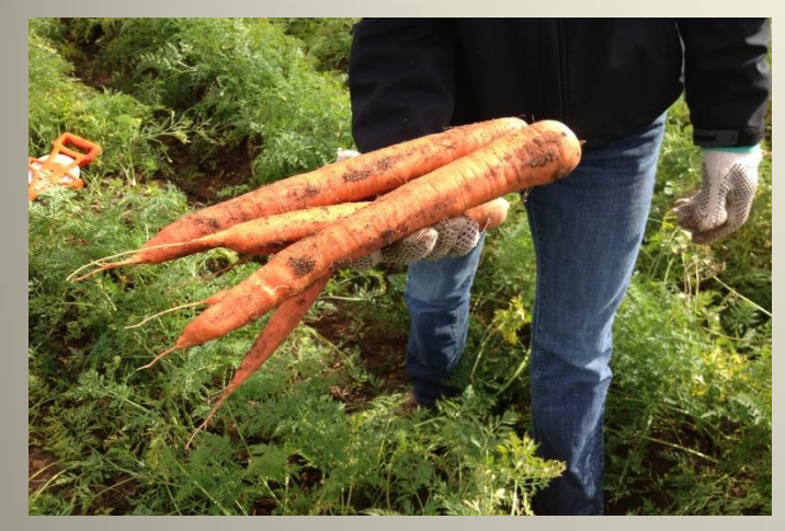
Carrots treated with Sure K foliar