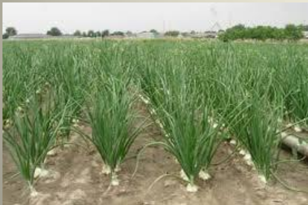
Onion Field Trial