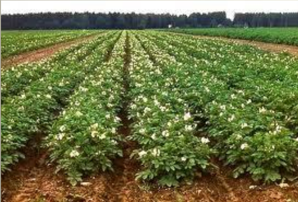
Potato Field Trial