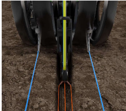
Figure 1. Conceal® and FurrowJet® Placement

Objective: To evaluate the yield and economic impact of a soybean liquid starter fertilizer nutritional program from AgroLiquid® using FurrowJet® and Conceal® (Figure 1.) The protocol consists of the following: