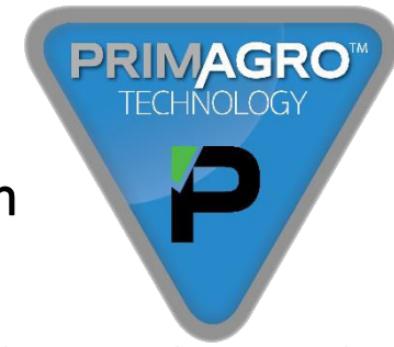
Planter Fertilizer Options in Corn Northern Maryland, 2019

All planter fertilizer treatments applied in-furrow and included PrimAgro K (5 GPA) + Micro 500 (0.5 GPA) + Iron (0.25 GPA) + Boron (4 oz/A). All treatments received 200 lb N. Trial conducted by Mulford Agronomics, Hebron, MD.