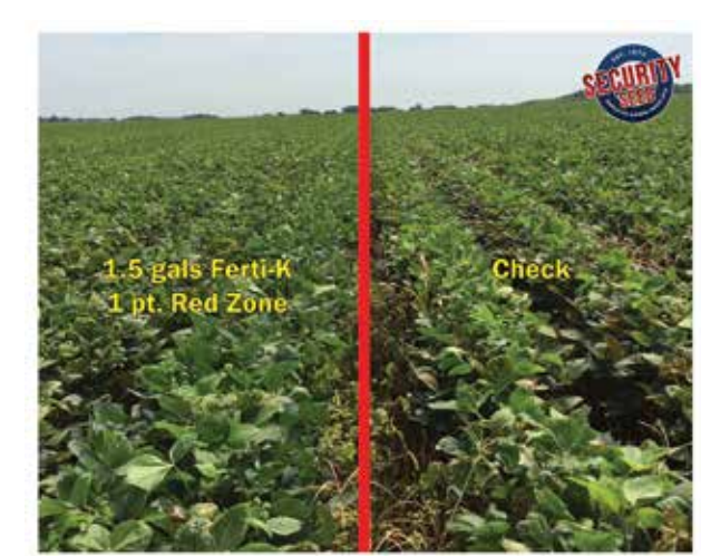
Bushel Increase (Average 2 Locations)

Ferti-K is a product that was developed through our research in conjunction with AgroLiquid. It is made from the highest quality raw materials and has shown a consistent yield response across multiple environments.